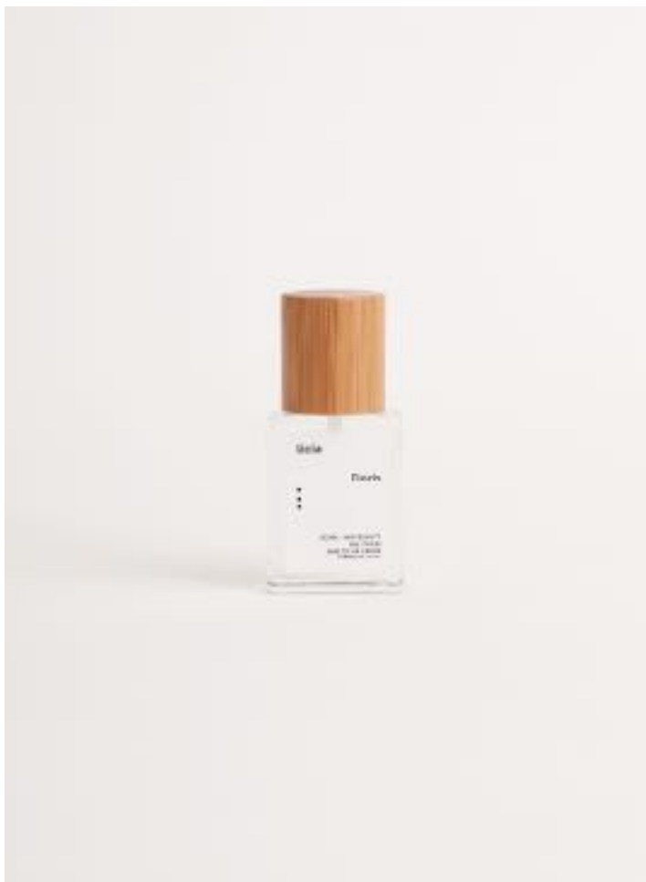
Sunshine Top Coat Nail Polish