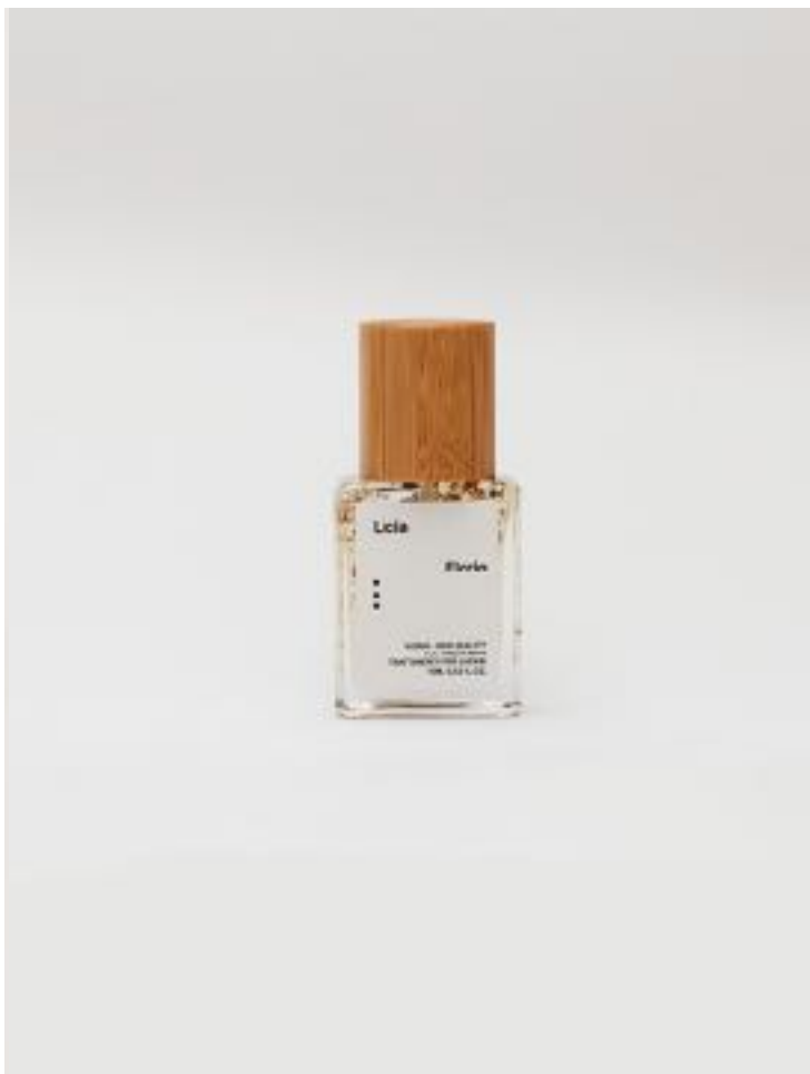
Flower Cuticle Oil Nail and Cuticle Treatment