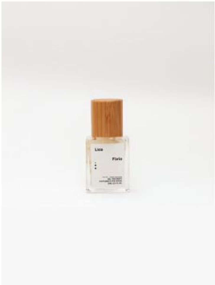
Sesame Scrub Nail and Cuticle Treatment