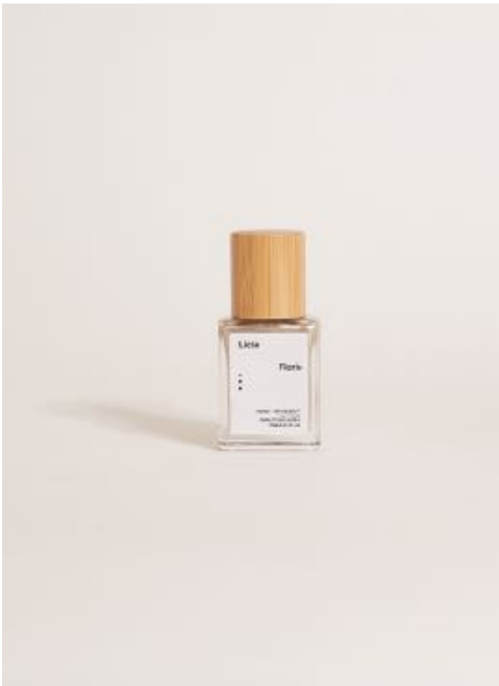
Mother of Pearl